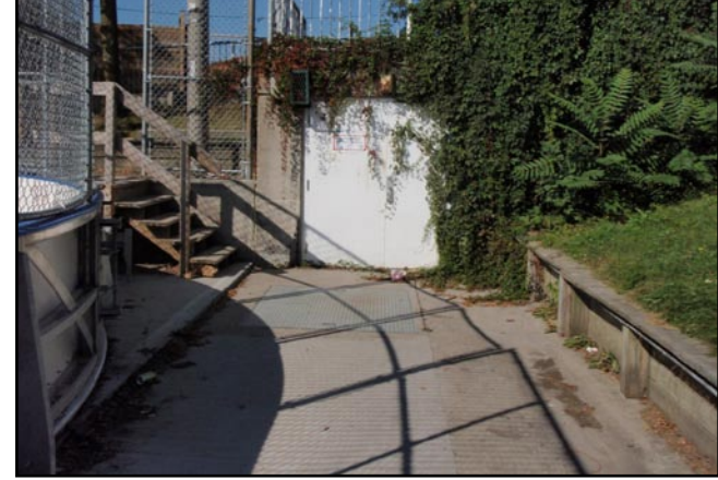
2013: garage to be built into the berm on the right

Then in three years, the city will finally build a concrete block garage into the berm, with an energy-saving feature: it will be heated by waste heat from the rink condenser! And there is no need to install a new gate leading into the rink from the garage – that gate was already installed when the rink was