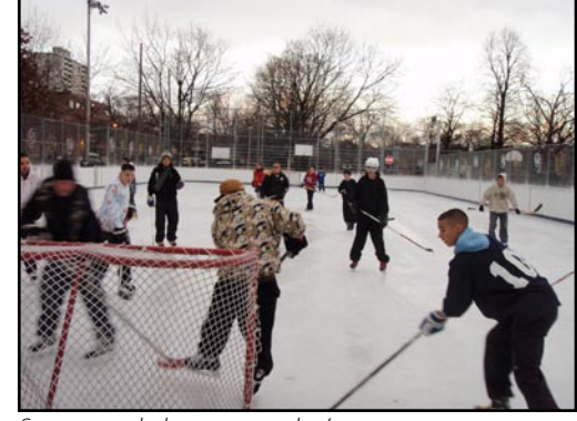
Some wear helmets, some don't

no one was getting angry at them. At the same time, the more positive approach brought back the at-risk youth, and the adults who preferred to make their own helmet choice.