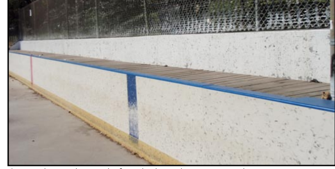
September 17th - just before the boxed were restored

its hinges, with a better latch that no longer trapped the players inside. Compliments were flying as fast as the puck.