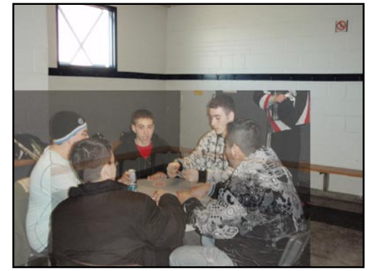
A card break between shinny games

them said they didn't mind, though. "The time goes by a lot faster," they said. As it got busier, the income from the skate rentals allowed the hiring of another rink staff, and some additional hours for the rink staff that wanted to earn more. A win-win!