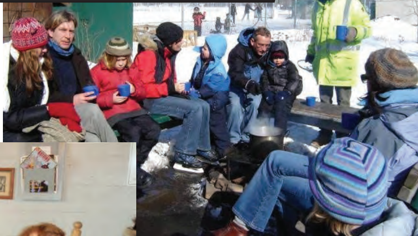
Community members and rec staff with hot chocolate by the fire pit