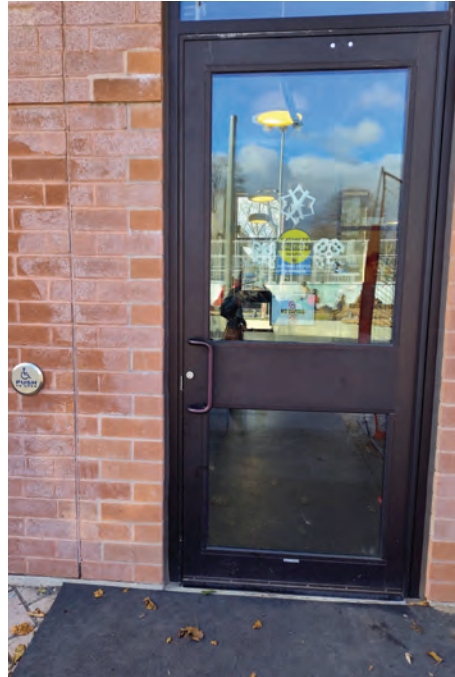
this door is too heavy for its opener mechanism