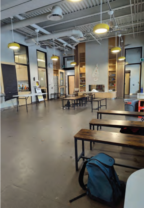
the main room feels more like a passage than a room