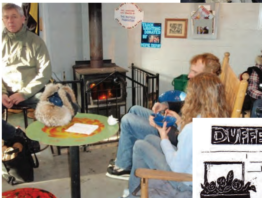
Gathering by the old wood stove