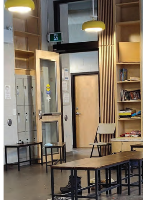
this door between the main room and lobby is installed backwards