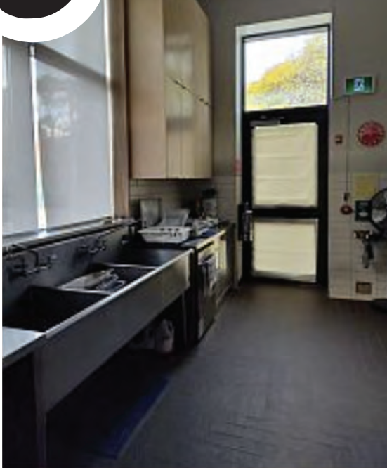
tall kitchen shelving