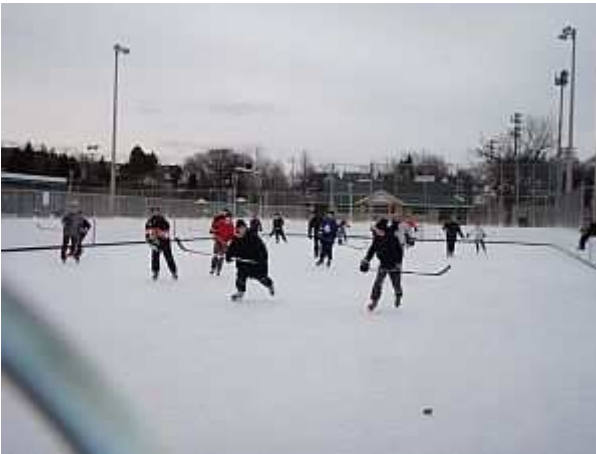
22 shinny players going after one puck