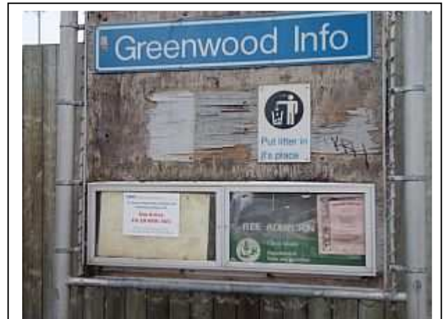
beaten-up bulletin board, out-of-date sign

Strengths: Double pad in residential neighborhood.