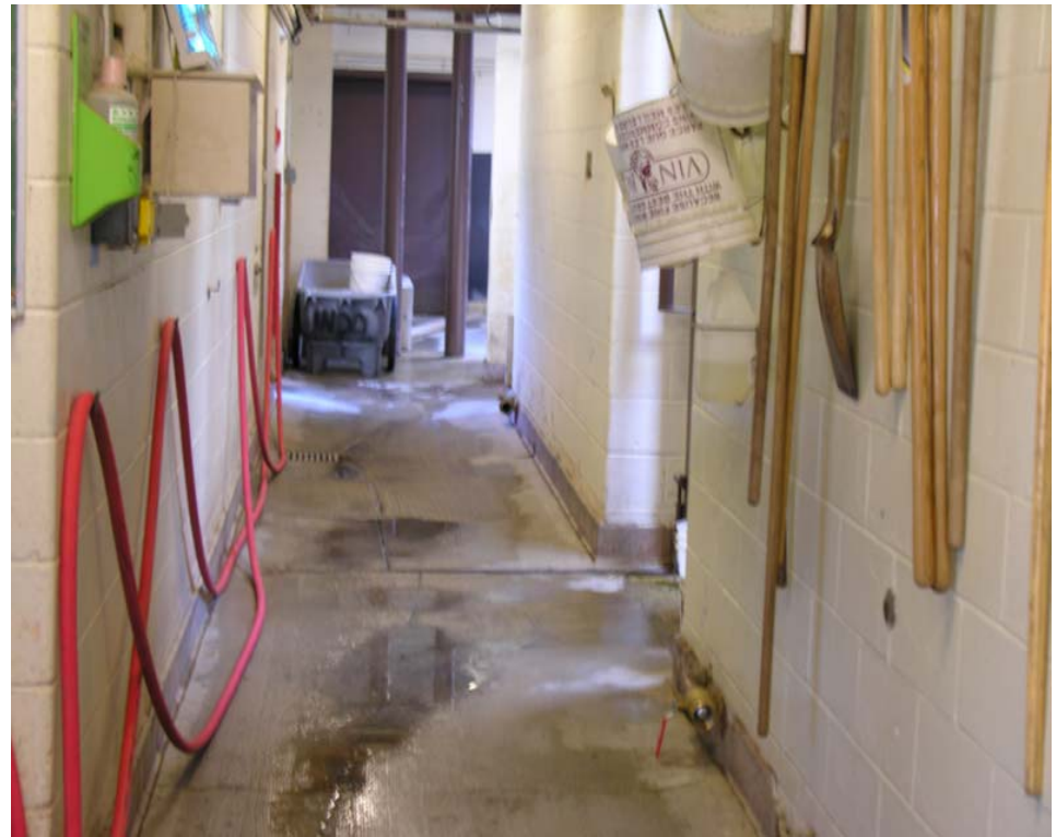
Indian Rhino Flooring