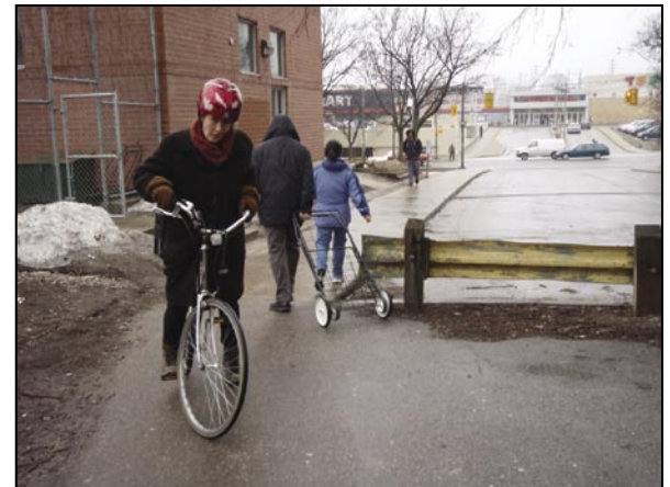
Looking West towards mall