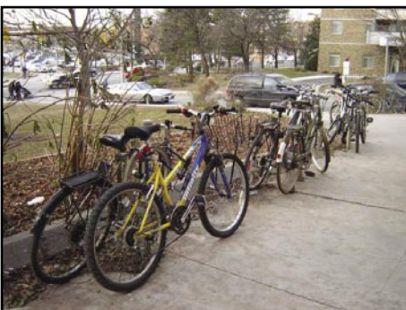
Full use of bike racks

Four years ago, the park got its first bike racks, but more are needed. This was on the list for last year, but it never happened.