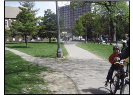
Trinity Bellwoods forked path