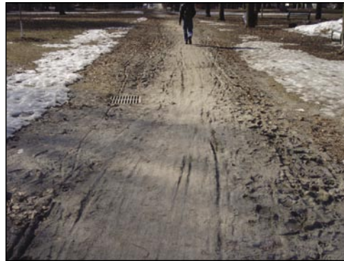
Bike ruts on main park path