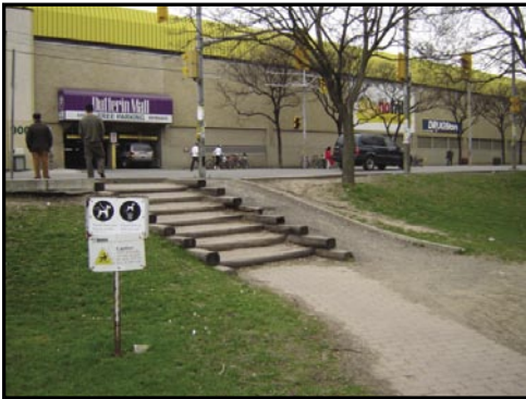
South stairs and bike ramp

Dufferin Grove Park is heavily used, and it’s also a de facto bike route. There are a few measures recognizing this, such as the asphalt ramp leading down from the south traffic light on Dufferin, right beside the stairs. But many of the paths used by bikes in the park are unpaved, and so they get deep ruts. However, the existing asphalt path north of the rink could be branched, in the same way as this bike path at Trinity Bellwoods Park.