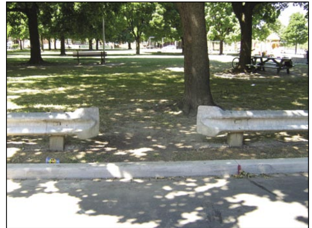
Carlton park barrier cut