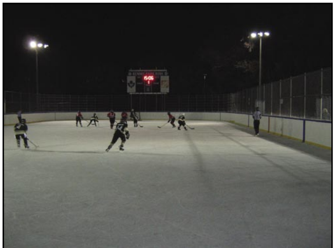
Rennie Rink January 7, 2008

The red line shows that the average temperature rises in March. But the blue line shows the problem with the angle of the sun. In December, the ice will stay hard at 10 degrees above 0. But by the end of March, the temperature has to be 10 degrees below zero, to get the same hard ice.