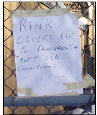
West Mall Rink March 12 -2C

In 2008, eight outdoor rinks were scheduled to remain open for two extra weeks after the first Sunday in March (the traditional rink closing time). Taking Dufferin Rink as an example: it had to be shut down for part of the day on 11 of the 14 extra days. 23 hours were lost because of snow. 55 hours were lost because of slushy or melting ice. Even though