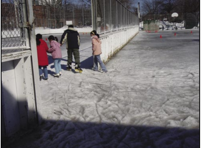
Dufferin Rink March 16, 2008