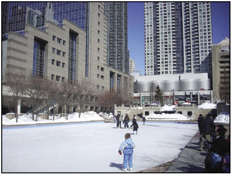
Mel Lastman Square March 2008

Even when the ice was in good shape, during March the usage at the eight rinks was less than half of normal except for Nathan Philips Square. At Rennie Rink the kids said: "hockey season's over!" At Dufferin Rink the skaters said they were coming less because they knew the ice might be bad.